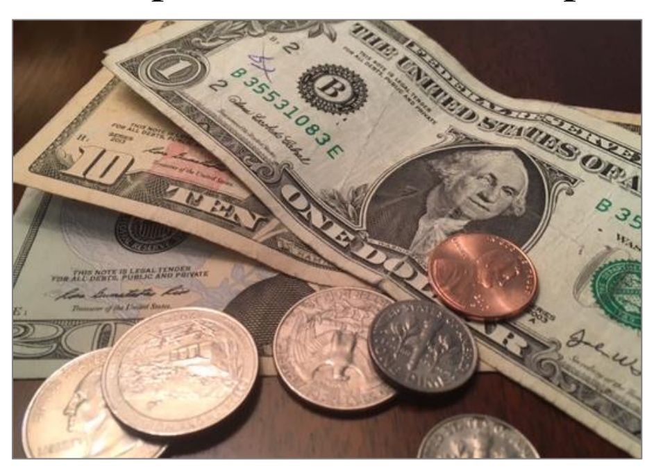
Issued July 1, 2017